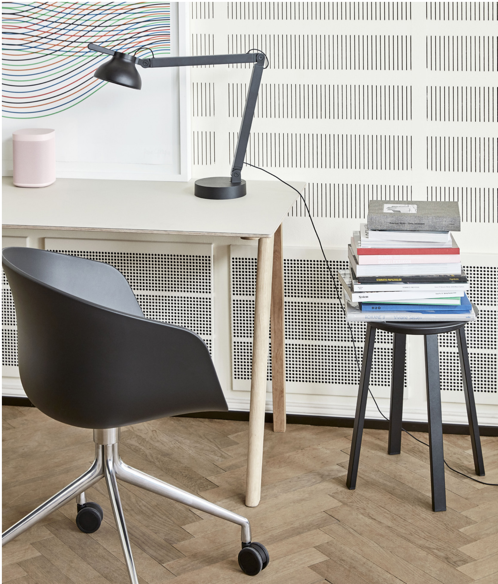
PC Desk Lamp | Soft black