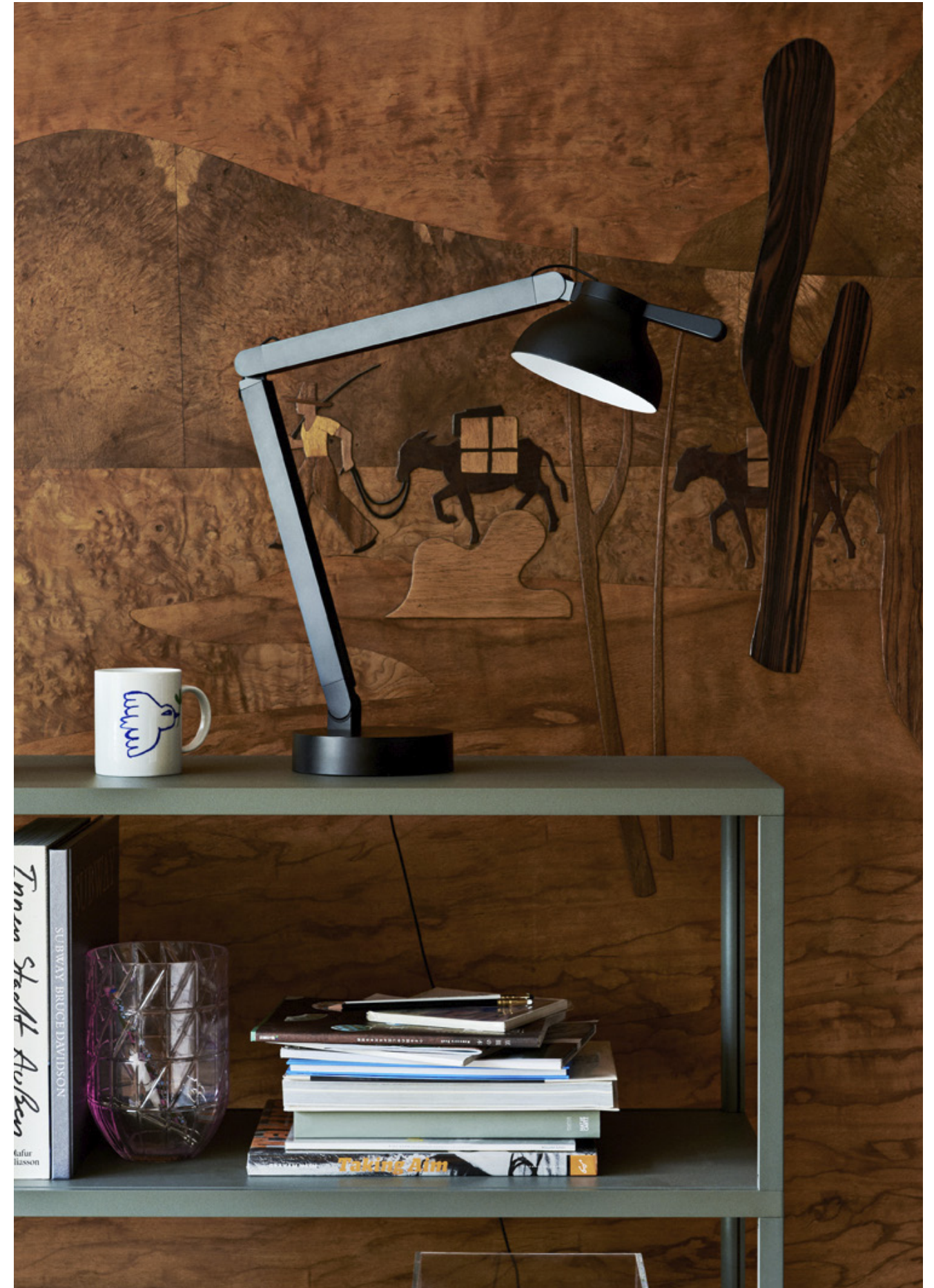
PC Desk Lamp | Soft black