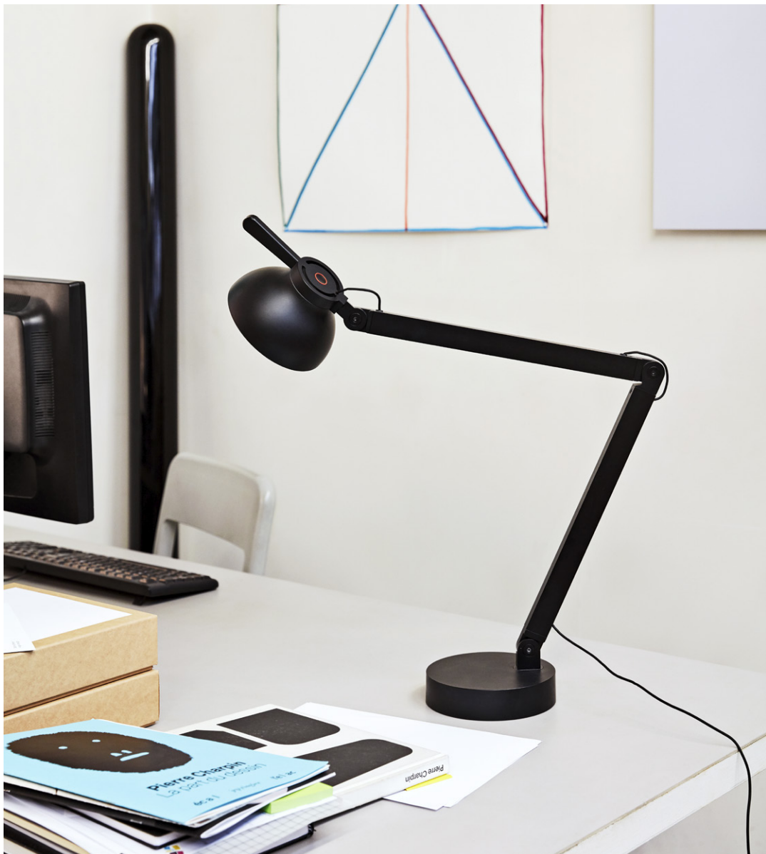
PC Desk Lamp | Soft black